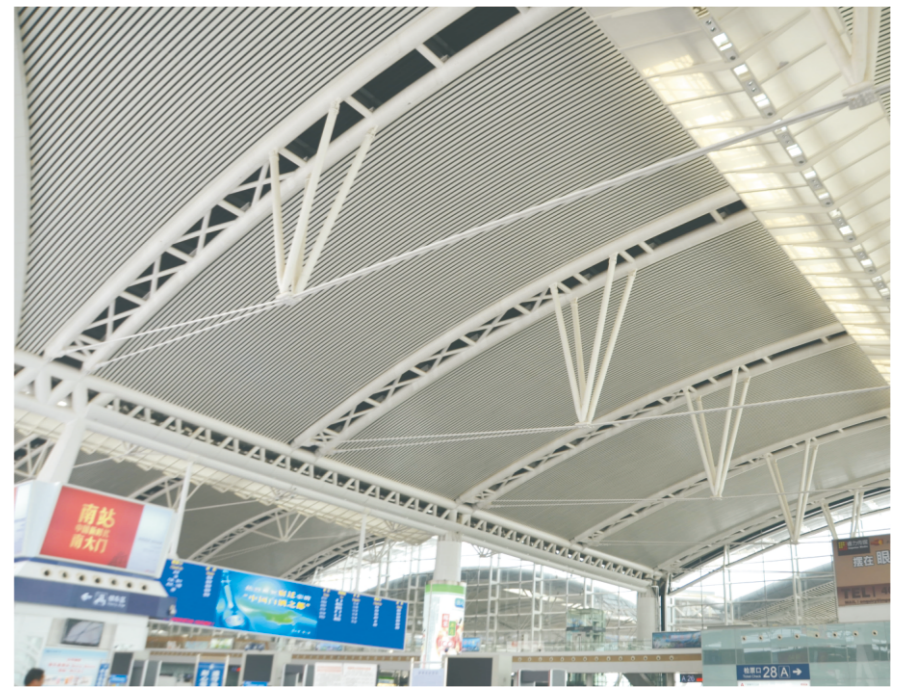
▲ Project: Guangzhou South Railway Station Product: Aluminum Square Tube Profile, Round Tube, PVDF Curtain Wall Aluminum Panel, Column Modeled Aluminum Panel, Arc Aluminum Panel