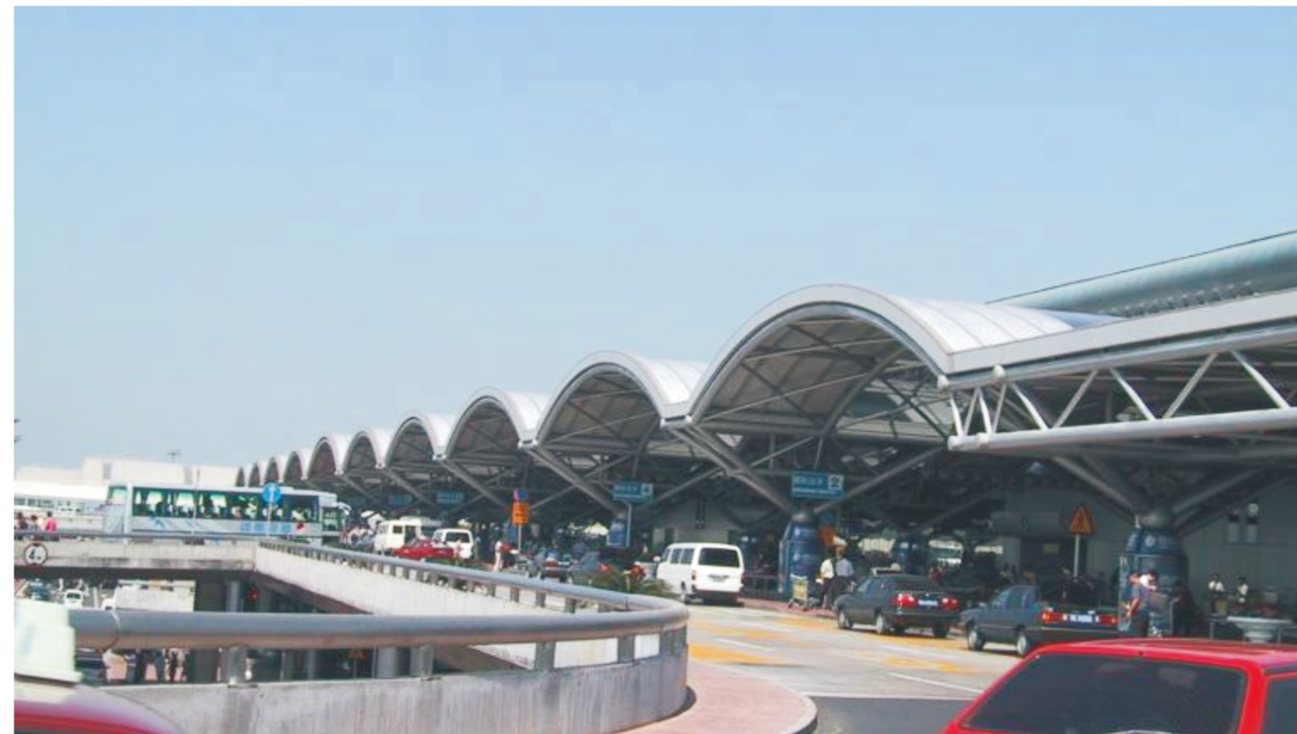
▲ Project: Guangzhou Baiyun Airport Product: Sunshade Panel, Metal Mesh Ceiling, Grid Ceiling, Perforated Triangle Panel, Column Modeled Aluminum Panel, Arc Aluminum Panel.