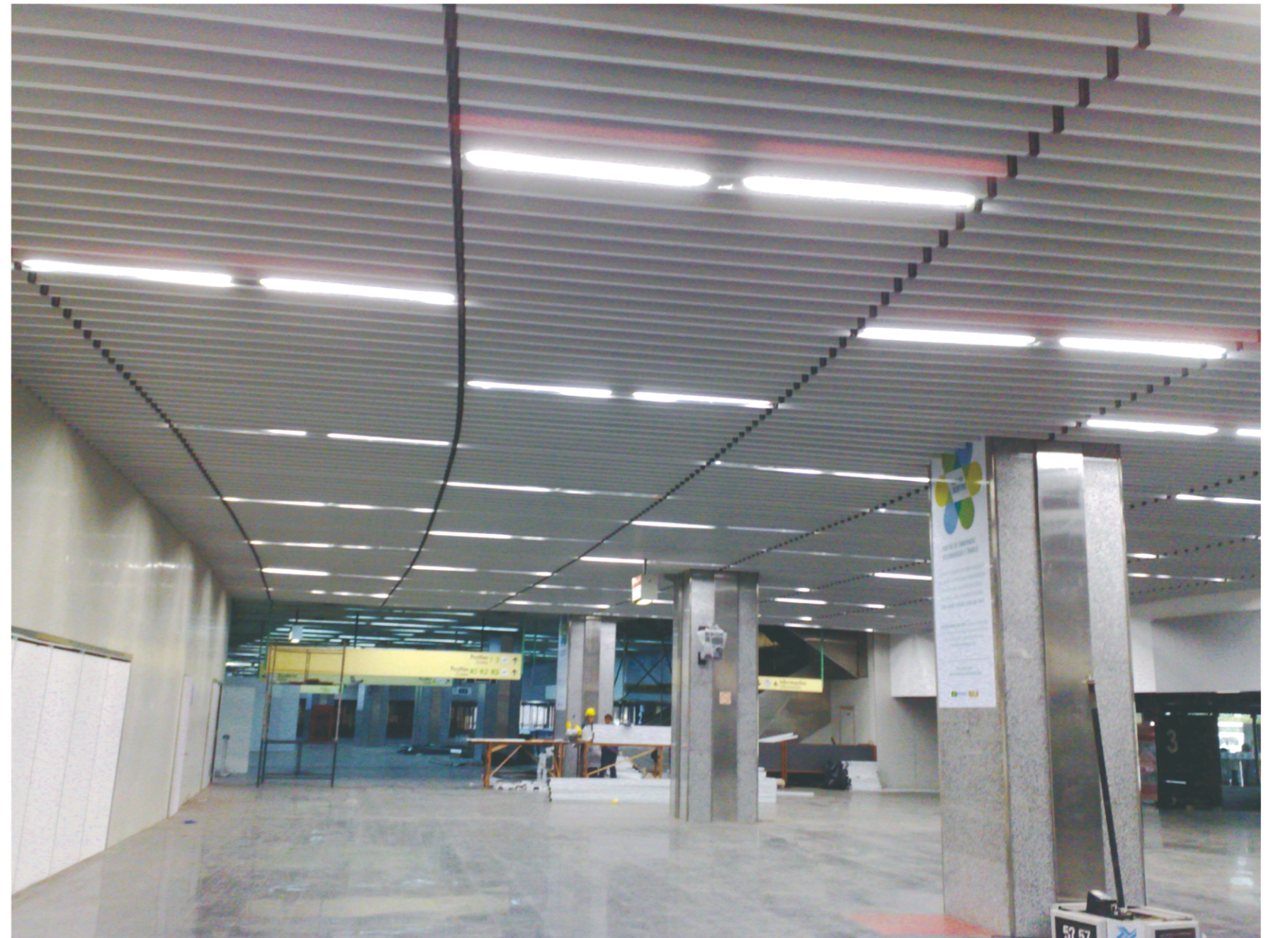
▲ Project: Guarulhos International Airport, Sao Paulo, Brazil Product: U-aluminum Profile Screen Ceiling