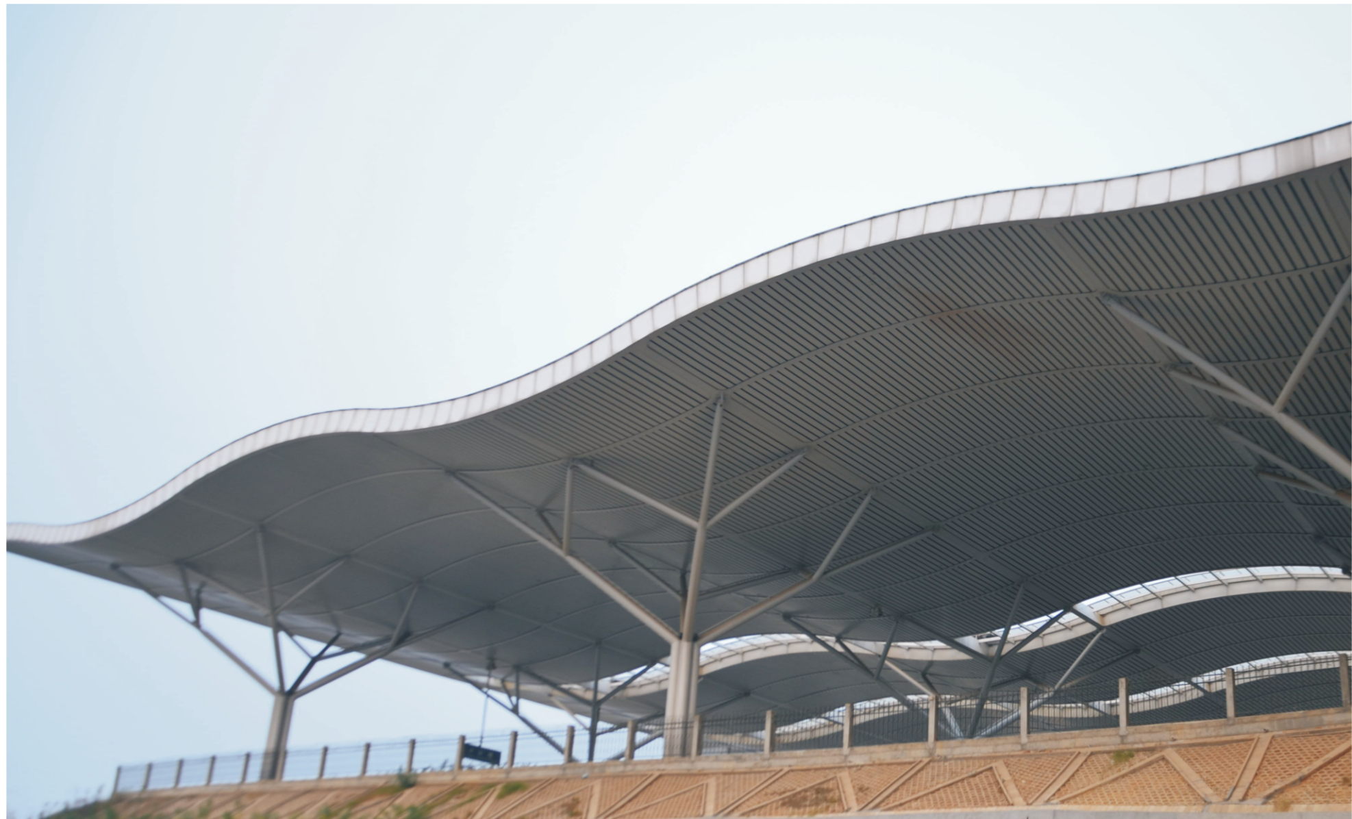
▲ Project: Changsha South Railway Station Product: Windproof Blade Ceiling, Strip Ceiling, Triangle Grid Ceiling, Round Tube, Arc Aluminum Panel