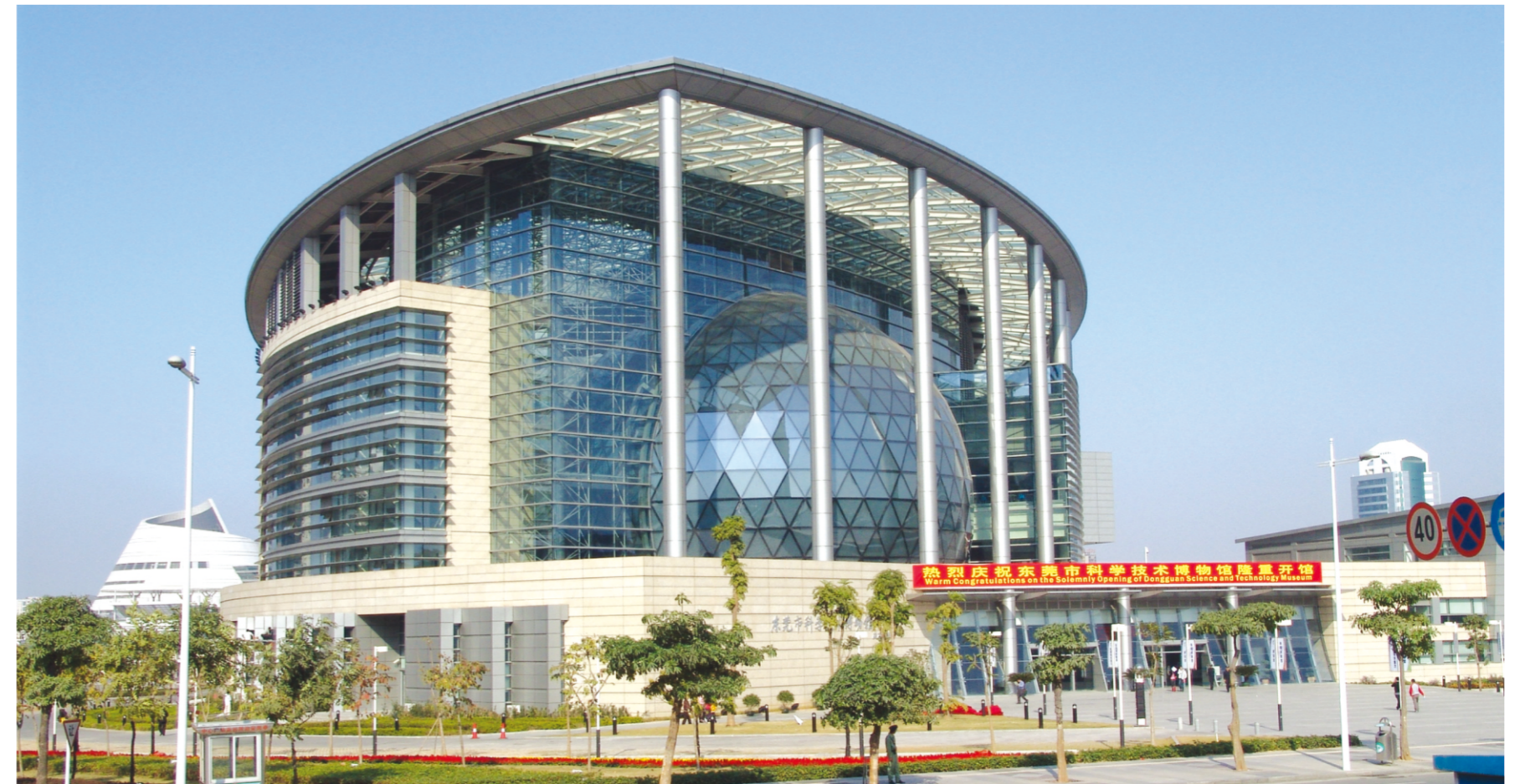
▲ Project: Dongguan Science & Technology Museum, Guangdong Product: Exterior Wall PVDF Aluminum Panel, Indoor Custom Panel, Column Arc Panel