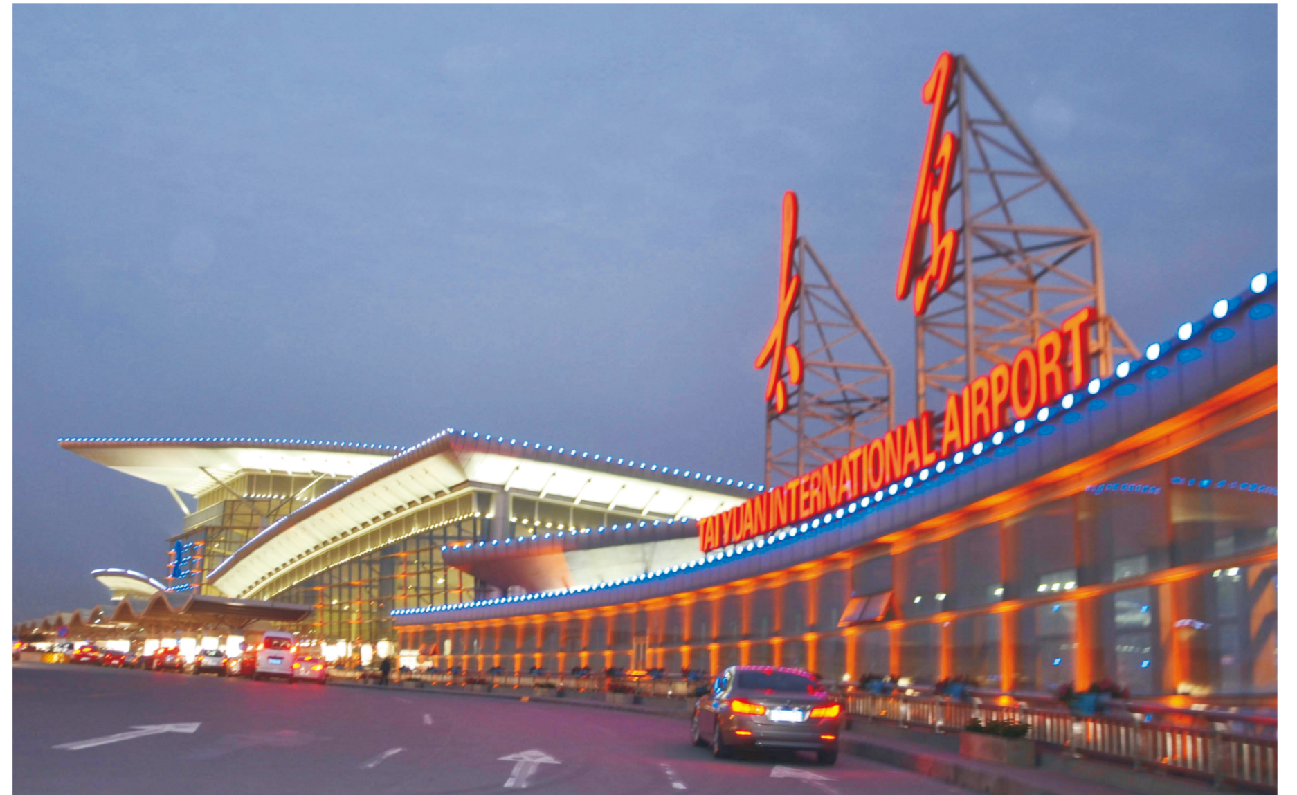
▲ Project: New Terminal of Wusu International Airport, Taiyuan, Shanxi Province Product: 600 × 600mm Square Ceiling, Exterior Wall Aluminum Panel, 300 × 1200mm Perforated Hook-on Ceiling, Column Modeled Aluminum Panel, Interior Wall Aluminum Panel.