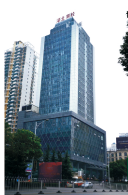
Wuhan Geosciences Bureau