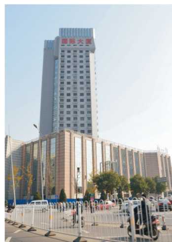
Taiyuan International Building, Shanxi