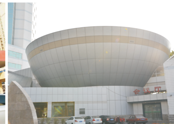
▲ Project: Shanxi Daily Office Product: Exterior Wall Aluminum Panel, Strip Ceiling