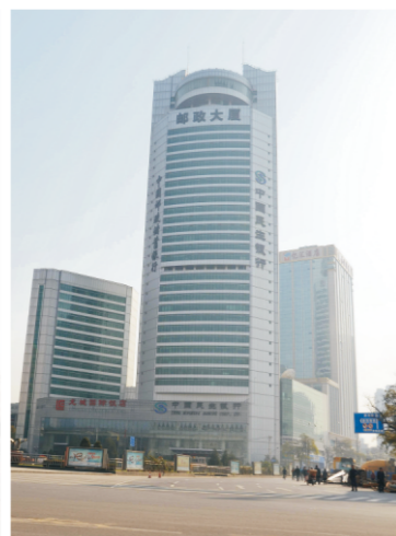
Taiyuan Post Tower, Shanxi