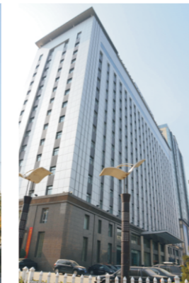
Shanxi Administrative Bureau for industry and Commerce