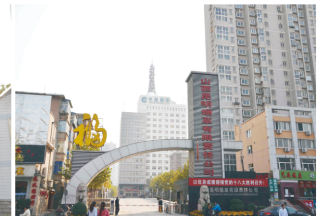
▲ Project: Shanxi Kunming Tobacco Co., Ltd. Product: Exterior Wall PVDF Aluminum Panel, 300 × 300mm Square Ceiling, Strip Ceilings