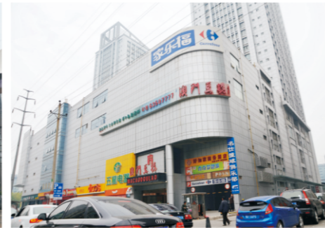
Zhenzhou Carrefour Market