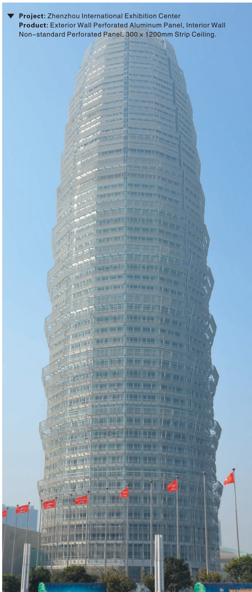
▼ Project: Zhenzhou International Exhibition Center Product: Exterior Wall Perforated Aluminum Panel, Interior Wall Non-standard Perforated Panel, 300 × 1200mm Strip Ceiling.