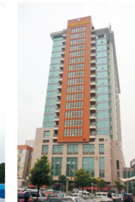
Zhenzhou Central Hospital