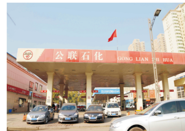
▲ Project: Taiyuan Gasoline Station Product: Strip Ceilings