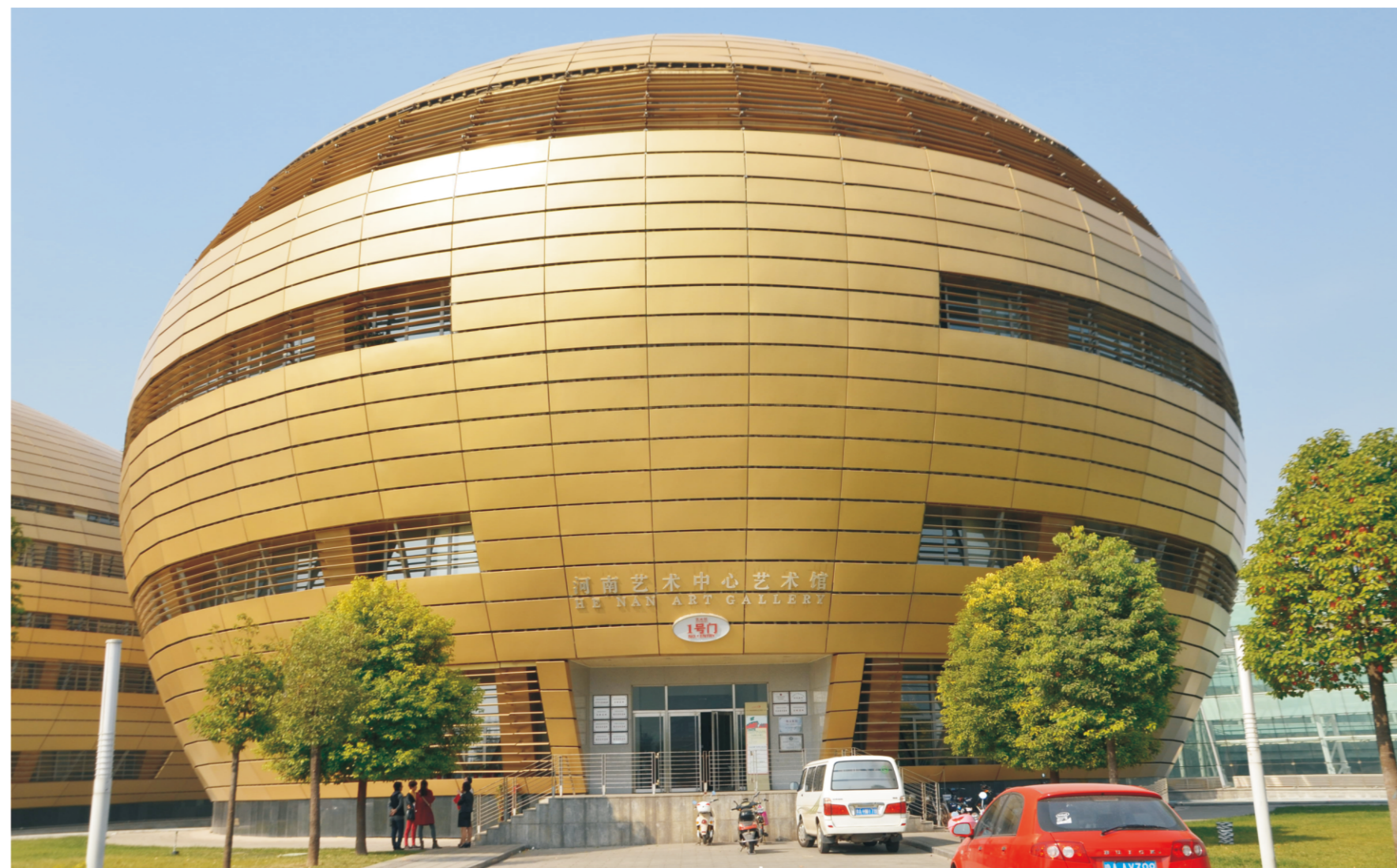
▼ Project: Henan Provincial Arts Center Product: Exterior Wall PVDF Aluminum Panel, Sunshade Panel, Indoor Custom Panel, Column Arc Panel.