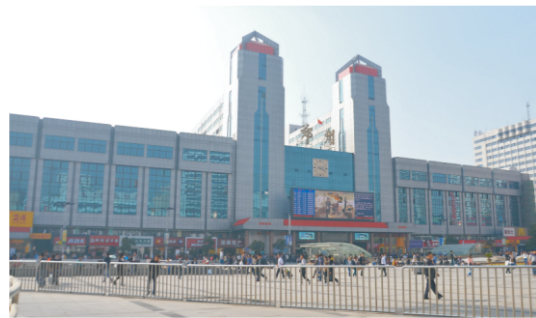
Zhenzhou Railway Station