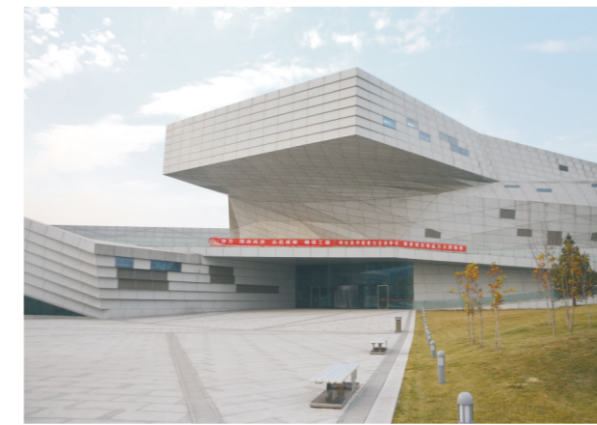
▲ Project: Taiyuan Art Gallery, Shanxi Product: Aluminum Panel, Indoor Non-standard Perforated Panel, Strip Ceiling