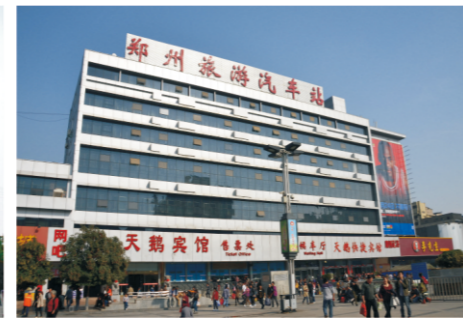
Zhenzhou Tourist Bus Station