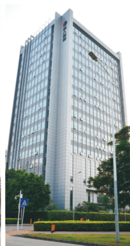
China GrenTech Corporation Limited