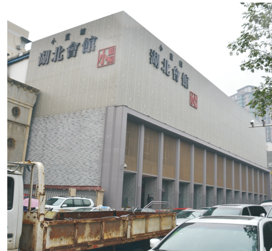
▲ Project: Hubei Guild Hall Product: Exterior Wall Art Flower Carved Decorative Panel, Strip Ceiling