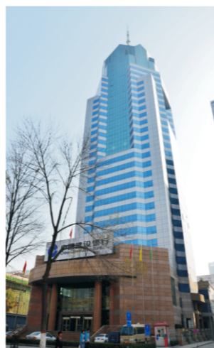
China Construction Bank Taiyuan Branch