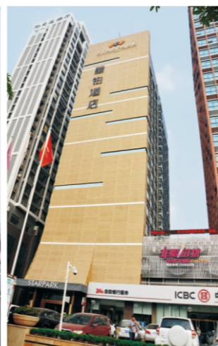
Shajing Xingbo Hotel, Shenzhen