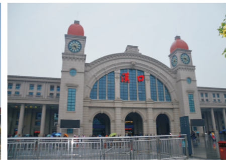
Hankou Railway Station, Wuhan