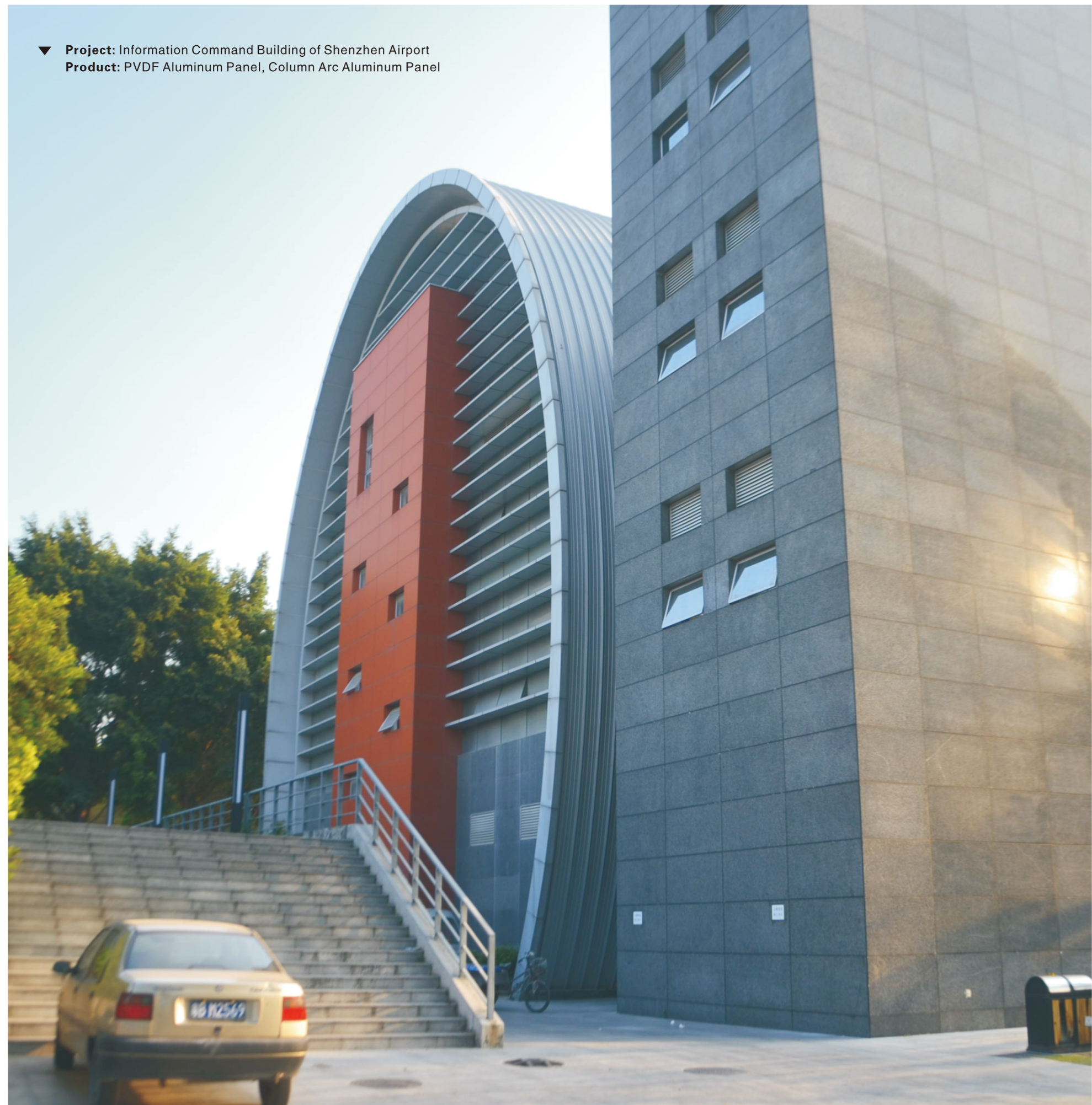
▼ Project: Information Command Building of Shenzhen Airport Product: PVDF Aluminum Panel, Column Arc Aluminum Panel