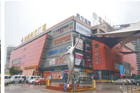
Xianglong Times Square, Wuhan