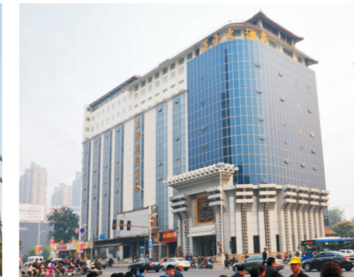
Zhenzhou Yashen Hotel