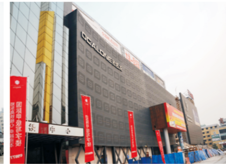
Zhenzhou Oukailong International Financial Centre