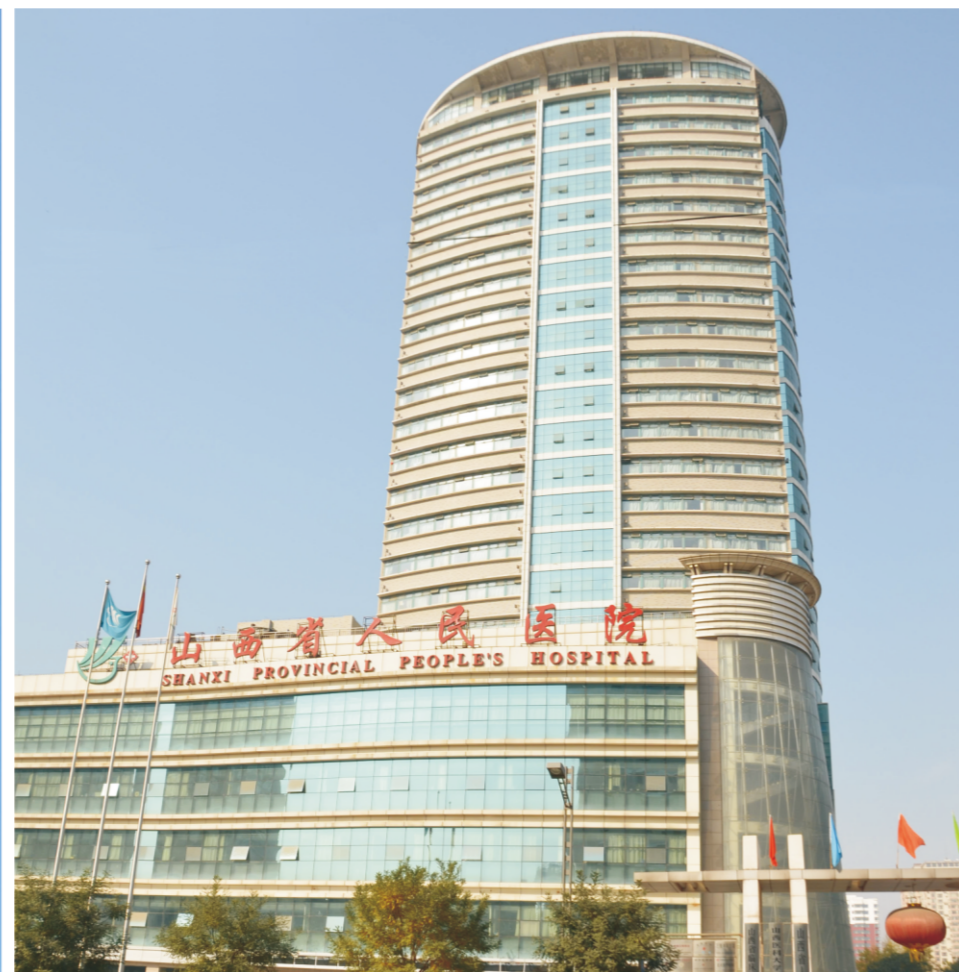
▲ Project: Shanxi Provincial People's Hospital Product: Exterior Wall Aluminum Panel, 300 × 600mm Square Ceiling.