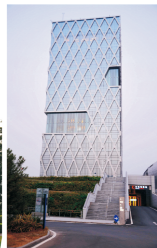
Shenzhen Nanshan Commercial Hotel