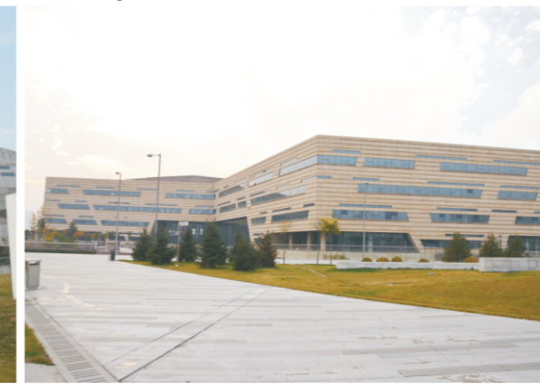
▲ Project: Shanxi Provincial Library Product: Aluminum Panel, 300 × 1200mm Perforated Square Ceiling, Strip Ceiling.