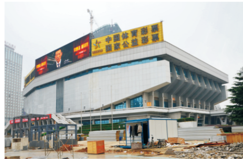
Hubei Sports Lottery Center