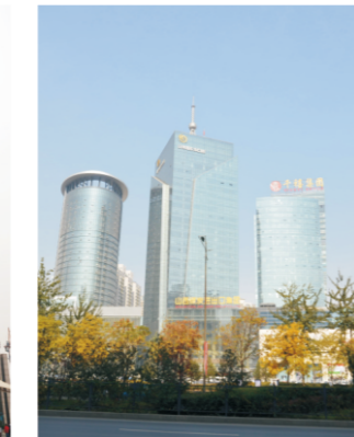
Shanxi Coal Import & Export Group