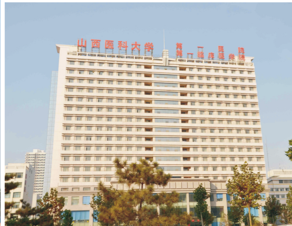
▼ Project: Shanxi Medical University First Hospital Product: 300 × 1200mm Perforated Ceiling, 300 × 600mm Flat Ceiling, Exterior Wall Aluminum Panel