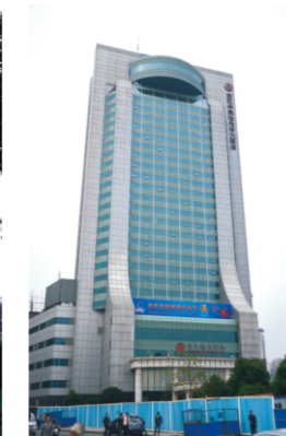
Meihuada Optical Valley Hotel, Wuhan