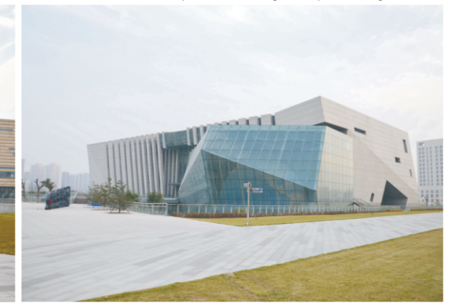
▲ Project: Shanxi Provincial Theatre Product: Indoor Non-standard Perforated Custom Panel, 300 × 1200mm Perforated Square Ceiling