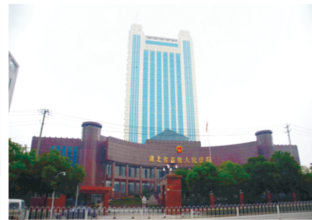
Hubei Higher People's Court